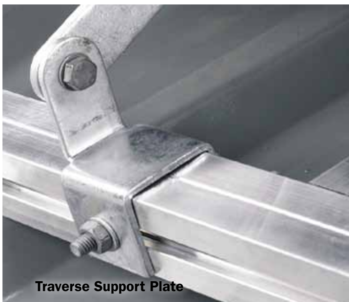
Traverse Support Plate

KEE WALK is designed to make the task of building a walkway across a sloping roof a straight forward installation, again using a standard set of components. A traverse section of walkway uses a standard KEE WALK section for the level walking surface which is mounted onto a sub-frame fixed to the roof. The two sections are joined with hinged brackets at the rear of the assembly and use the rotating arms at the front to level the walking surface, as depicted on the adjacent photograph.