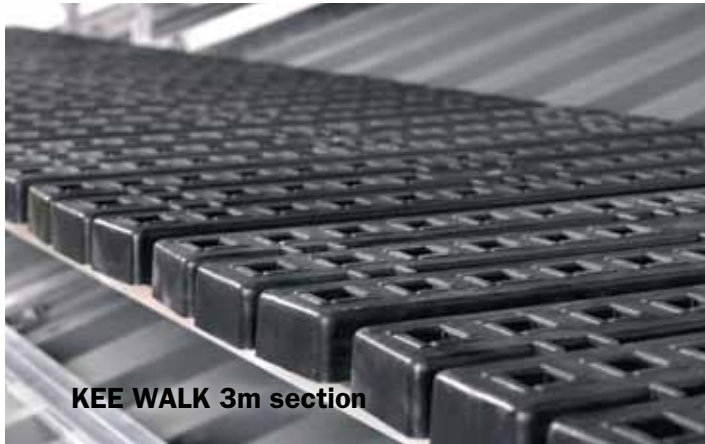
KEE WALK 3m section

KEE WALK provides a flexible, easy to assemble walkway system designed for use on most modern roof types. To demonstrate the flexibility of the system, a brief explanation of the key constituent parts; the longitudinal configuration, the configuration to traverse a roof, the step configuration and the treads is given below. The anti-slip characteristics of the walkway are essential for user safety. The British Standard (BS 4592) requires a minimum co-efficient of 0.4 as a measure of the friction and KEE WALK achieves almost double this in both wet and dry conditions. Specific fixing packs are supplied for the different roof types.