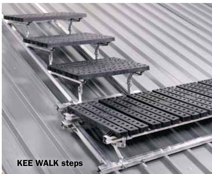
KEE WALK steps

Kee Safety provides pre-assembled step configurations in 3m or 1.5m lengths which require only minor adjustment on-site. The rotating arms (shown above) allow the installer to set the angle of the steps simply by removing the locating bolt, setting the horizontal angle and then replacing the bolt. The steps configurations will change depending on the pitch of the roof. Standard components are available for 5° - 10°, 10° - 15°, 15° - 25°, 25° - 35°, all which comply with the requirements of EN 516. Kee Safety can provide specific information on all the different step configurations as required.