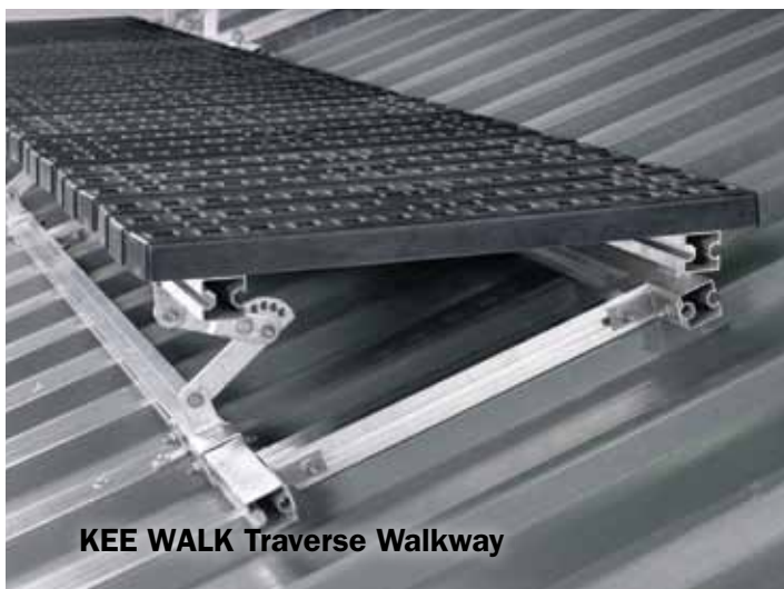
KEE WALK Traverse Walkway

Supplied pre-assembled by Kee Safety to facilitate rapid on-site installation and thus minimise installation costs, these standard lengths have 12 treads per 3m. Weighing only 24kg, the standard lengths are easily positioned and aligned. They are joined together by a simple 100mm long straight connector which attaches to the bearer bars.