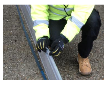
Pull out the 'R' Clips and release the two Cross Braces from their stowed position.