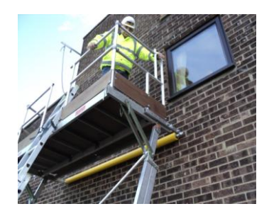
Climb onto the Platform and position the rear Uprights into the rear locating sockets on the Platform for both the Left and Right handed Guardrail. Make sure all uprights have been secured with Pins & 'R' Clips provided.