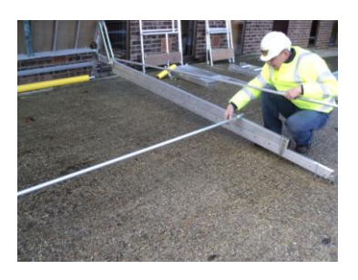
Fit the Horizontal Brace over the retaining studs.