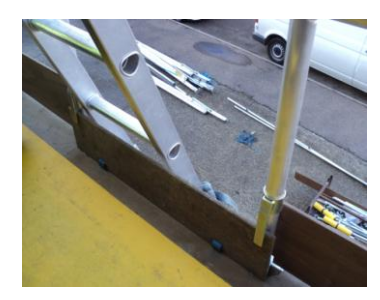
Raise the Toe-Board across the Ladder access point and close the Draw Bar.