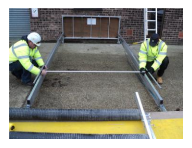
Lay out the components ready for assembly with the platform against the wall with wheels on the ground. Identify the corresponding leg for each side of the platform (Green – Left / Red – Right)