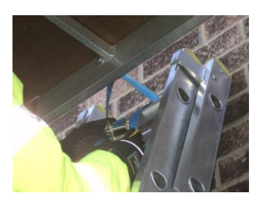
For additional safety the Easi-Dec will always be fixed to the wall via an Eye-Bolt.