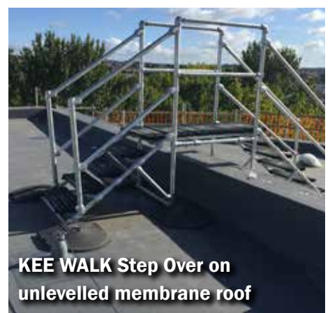
KEE WALK Step Over on unlevelled membrane roof