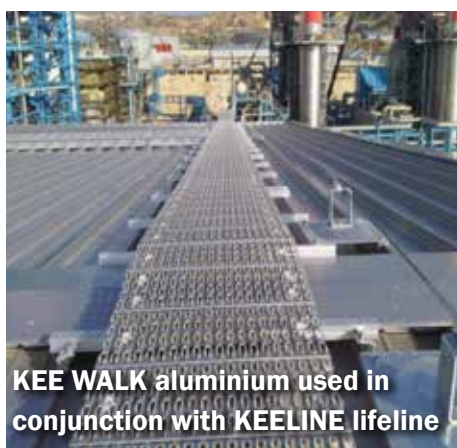
KEE WALK aluminium used in conjunction with KEELINE lifeline

Can be used in conjunction with other products to provide a complete fall protection plan.