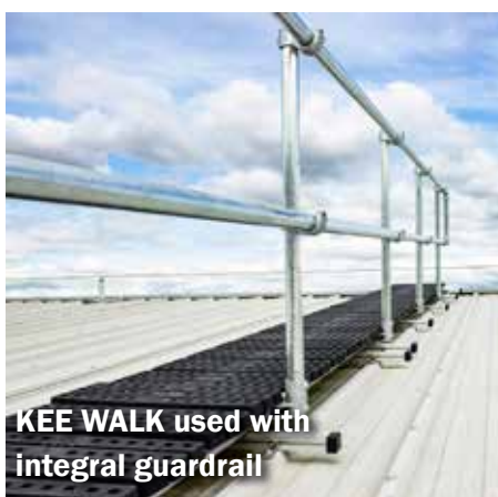
KEE WALK used with integral guardrail